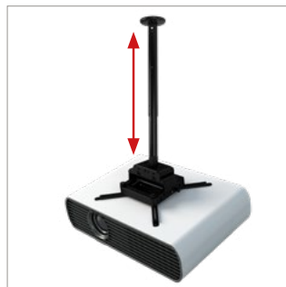
Adjustable drop in 25mm increments for the easy positioning of projector height