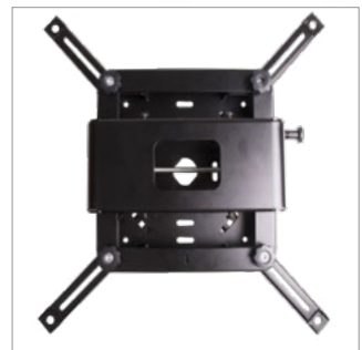
Optional extension legs can be used to accommodate larger fixing patterns