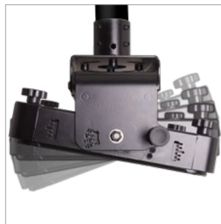
Features easy, incremented tilt adjustment