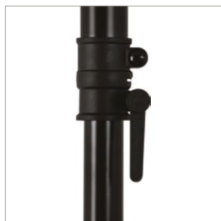
Hand lever for easy adjustment of ceiling drop, from 580mm to 830mm