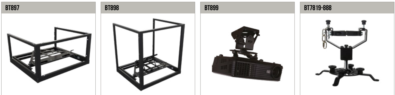
Stackable Heavy Duty Projector Mount designed for projectors up to 75kg