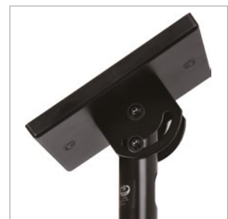
Ideal for angled or cathedral ceilings