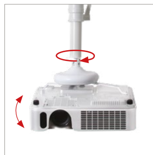
Ball joint adjustment for easy positioning of projector