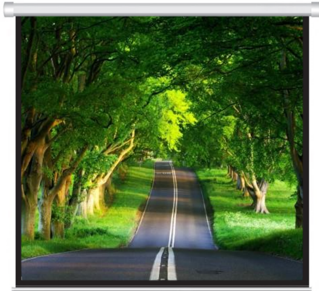
PTO for technical specifications